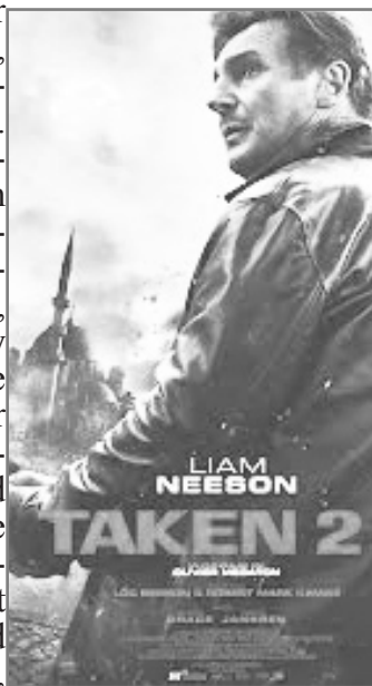
Liam Neeson poses for the moment

first film. The audience was moderately aware of the outcome at the end of the movie without yet seeing it. They knew that their hero would of course, overcome the obstacles he faced, whether they be the thugs under Serbedzija or the torment of watching his family suffer in front of him. If you haven’t seen Taken , Taken 2 will surely seem original but even if you have seen the first film, the second won’t fall short of satisfying your hunger for Neeson’s return as everyone’s favorite protective father.